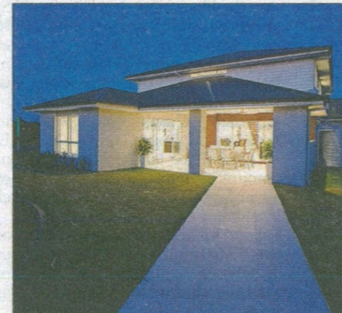
Palladio Home offers some 40 display homes as well as offering to build a customer’s design

This 384sqm home offers four separate living areas downstairs and four bedrooms and two bathrooms upstairs