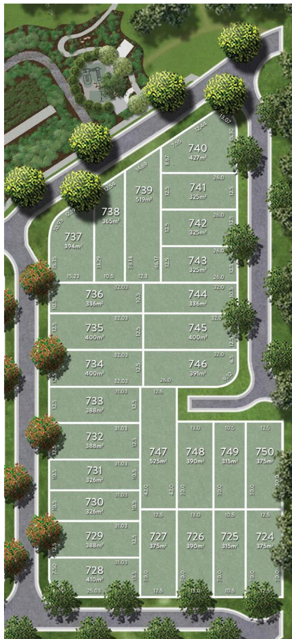
Home Design sited to scale on Lot 738 Disclosure Plan