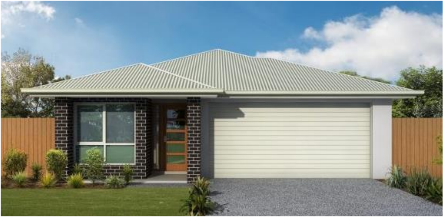
Façade for Illustration Purposes Only

4 Bedrooms, 2 Bathrooms, Double Garage, Media Room & Study (on display)