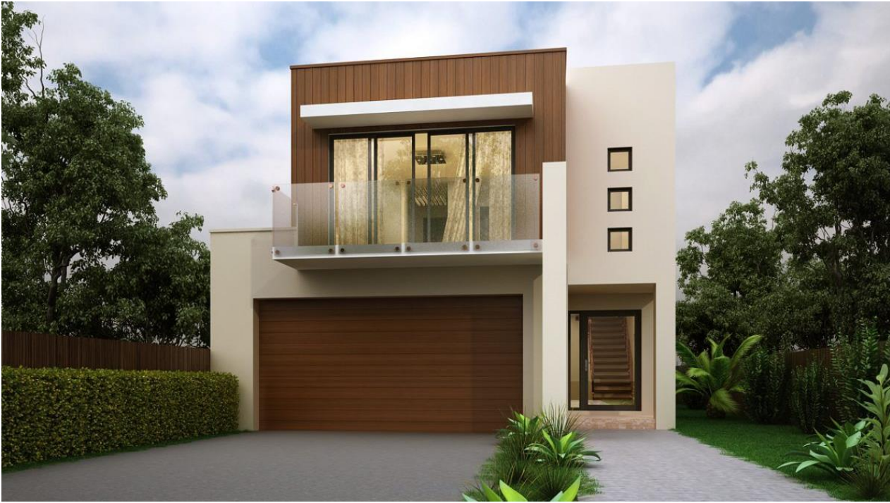
Ultimo Façade included - Indicative

4 Bedrooms, 2.5 Bathrooms, Double Garage, Media, Leisure + Front Balcony