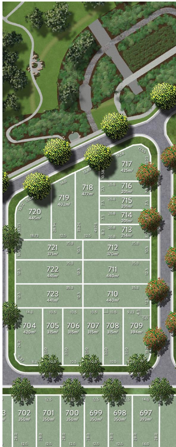
Home Design sited to scale on Lot 719 Disclosure Plan