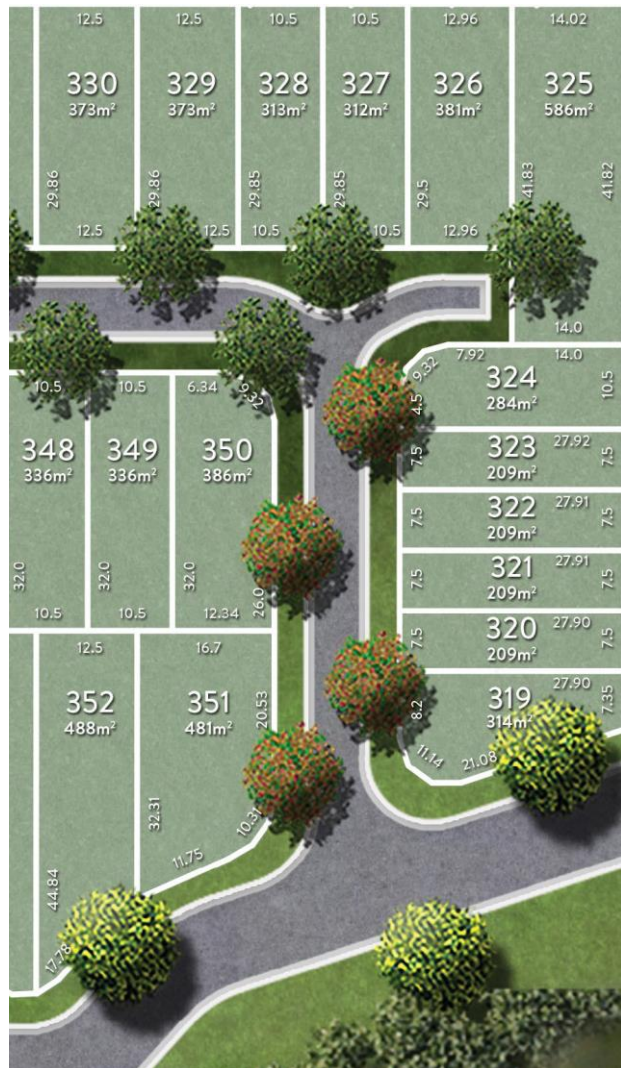
Home Design sited to scale on Lot 325 Disclosure Plan