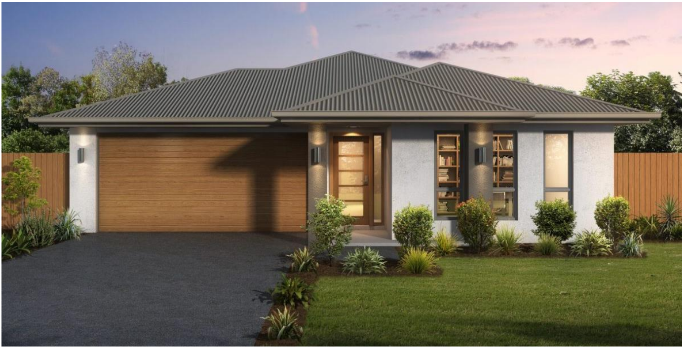
Vogue Façade - Indicative

5 Bedrooms, 2 Bathrooms, Double Garage, Study, Media + Children's Retreat