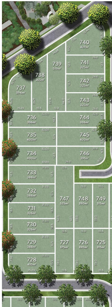
Home Design sited to scale on Lot 747 Disclosure Plan