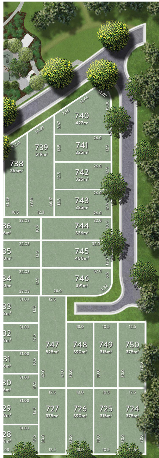
Home Design sited to scale on Lot 742 Disclosure Plan