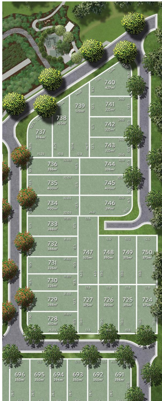
Home Design sited to scale on Lot 738 Disclosure Plan