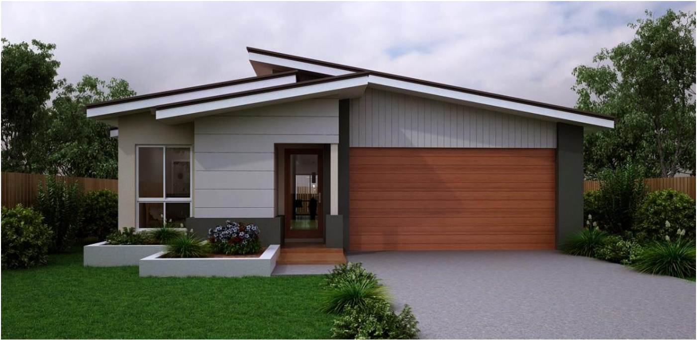
Coastal Façade as illustrated