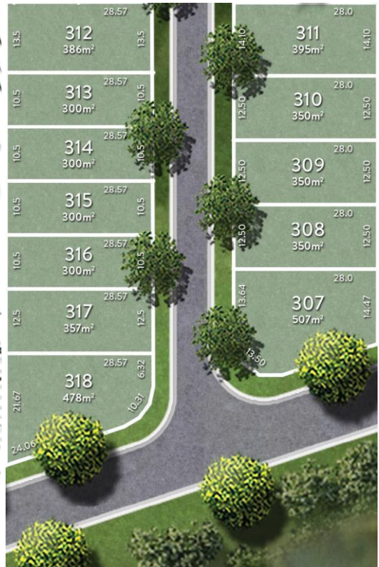
Home Design sited to scale on Lot 307 Disclosure Plan