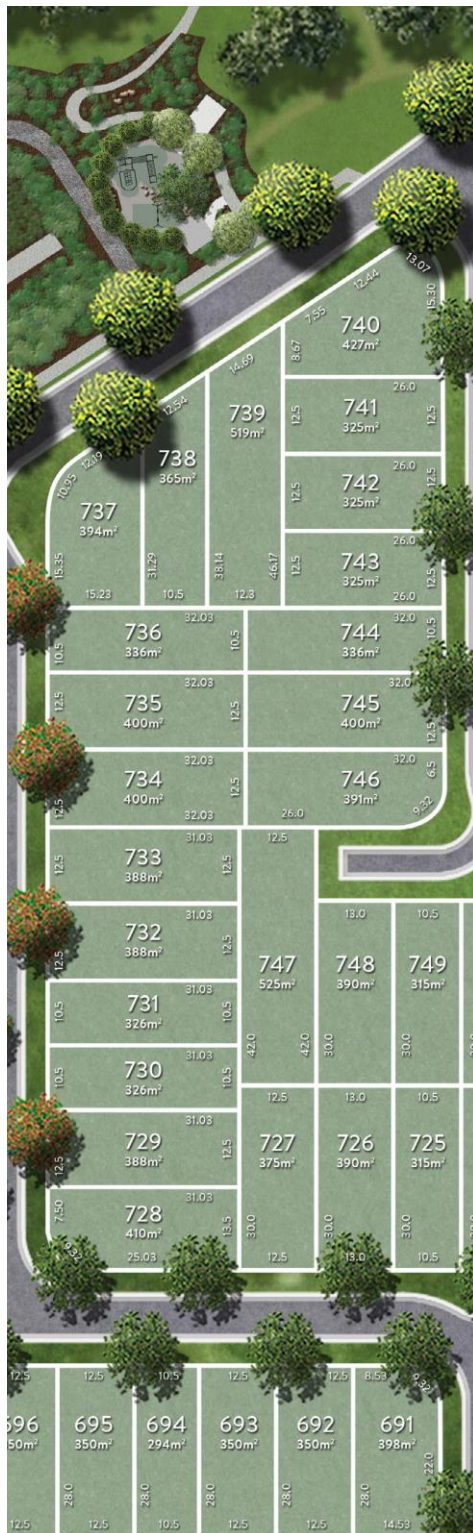
Home Design sited to scale on Lot 732 Disclosure Plan