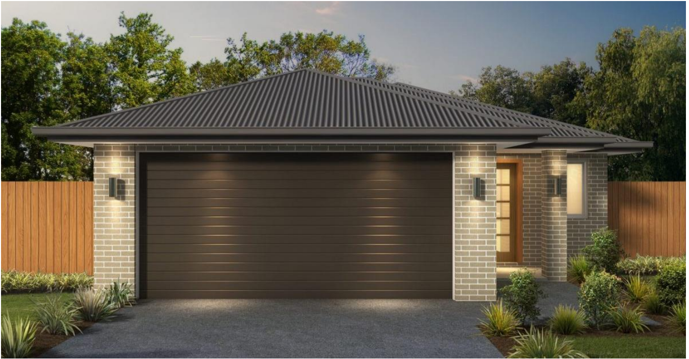
Vogue façade as illustrated

3 Bedrooms, 2 Bathrooms, Double Garage, Walk in Linen & Study