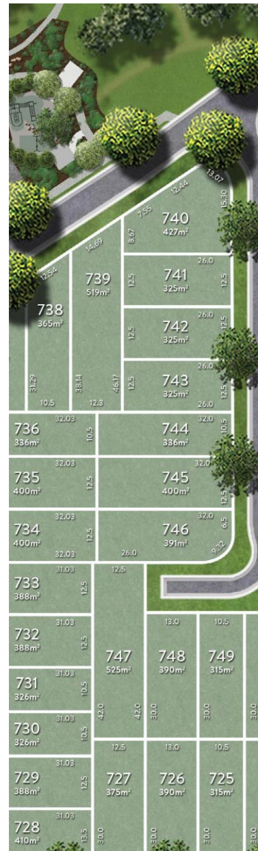
Home Design sited to scale on Lot 740 Disclosure Plan