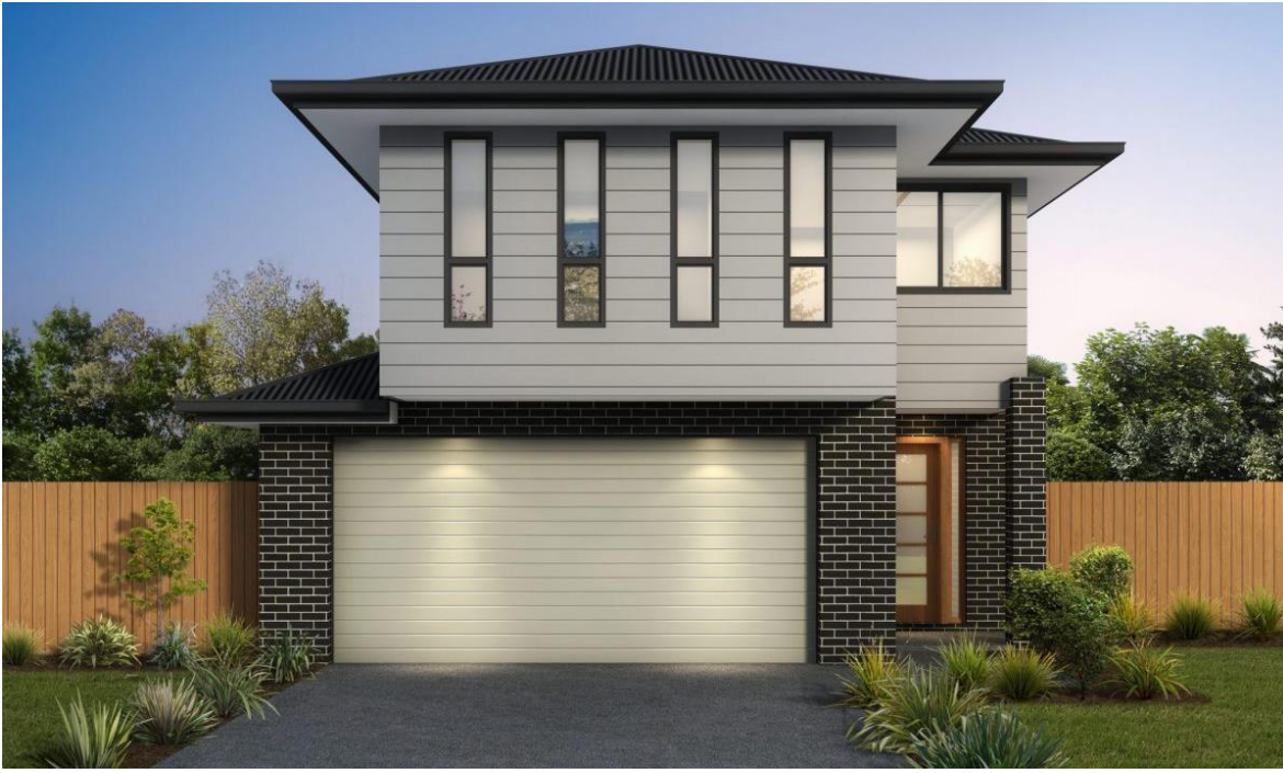
Vogue Façade included - Indicative

4 Bedrooms, 2.5 Bathrooms, Double Garage, Media + Leisure