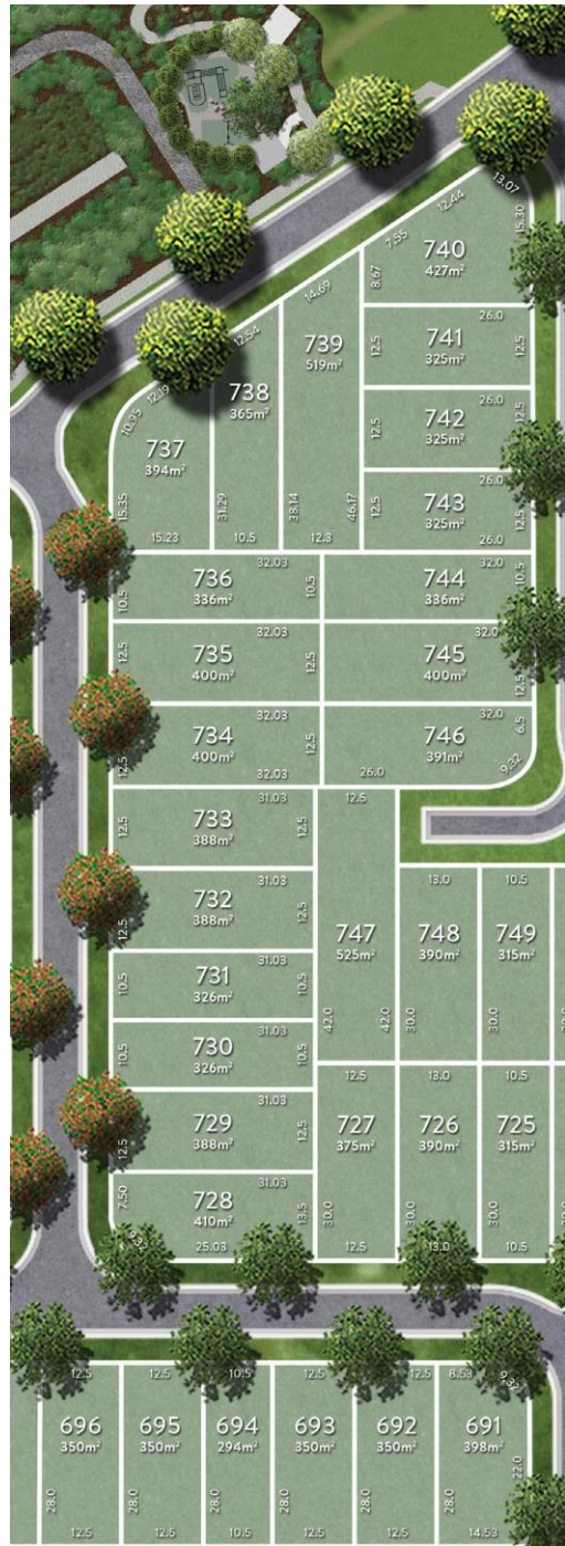
Home Design sited to scale on Lot 732 Disclosure Plan