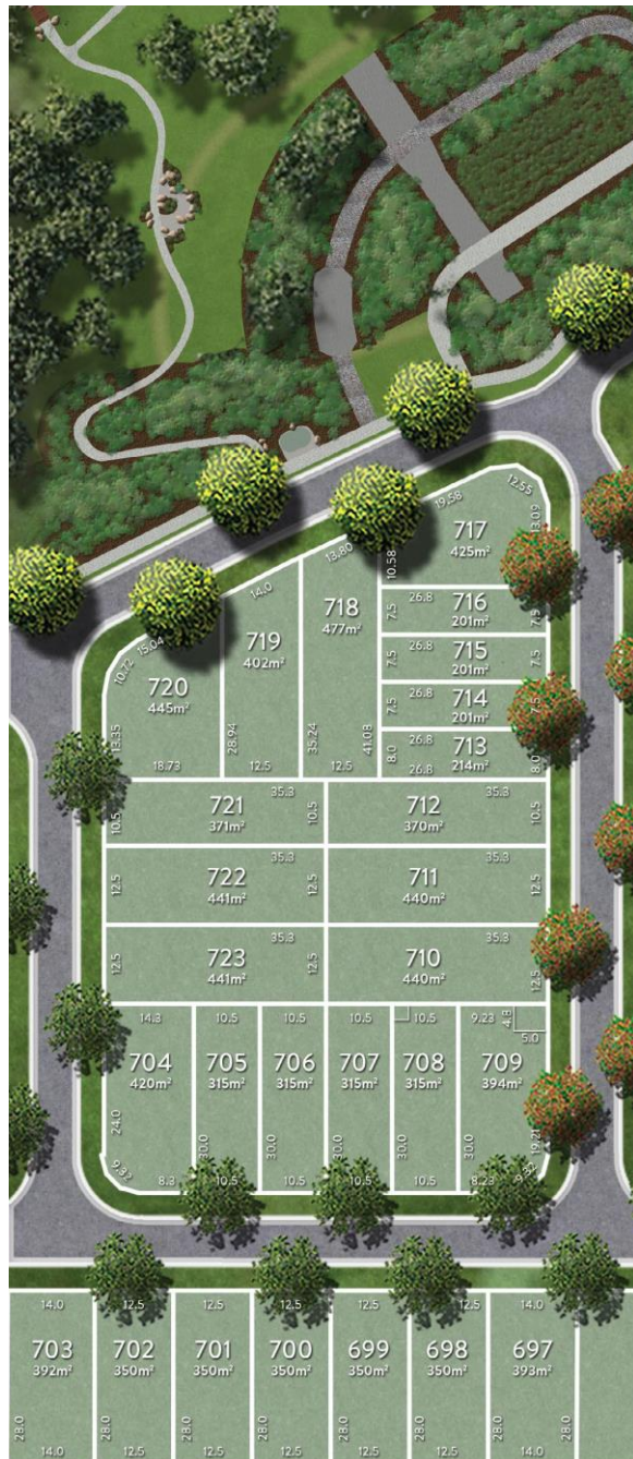
Home Design sited to scale on Lot 709 Disclosure Plan